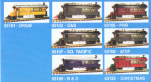
83101 - DRGW