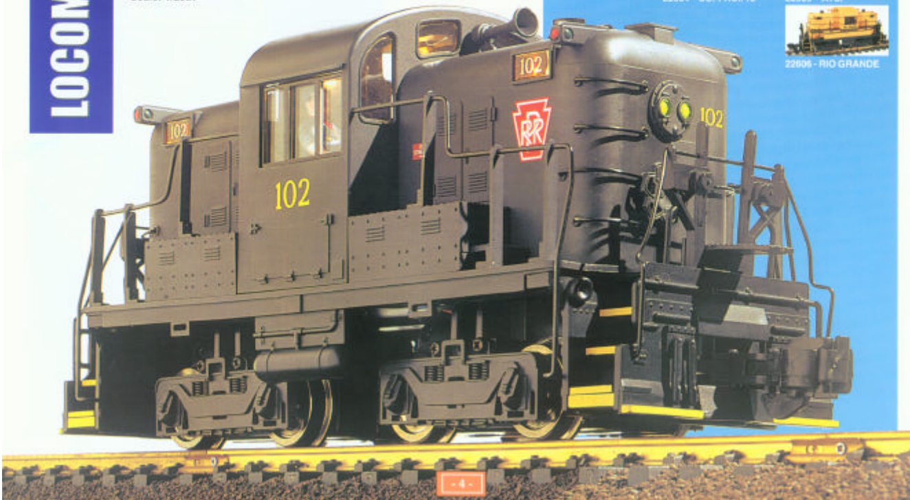
- 4 -