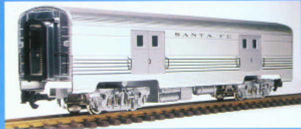
ART-32200 STREAMLINE BAGGAGE CAR (Production Model)