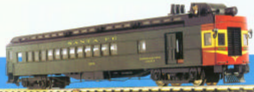
ART-21200 DOODLEBUG (Production Model)