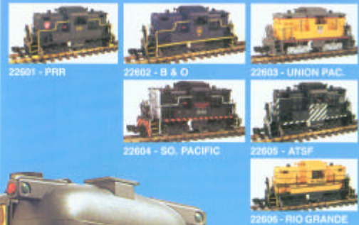
22601 - PRR