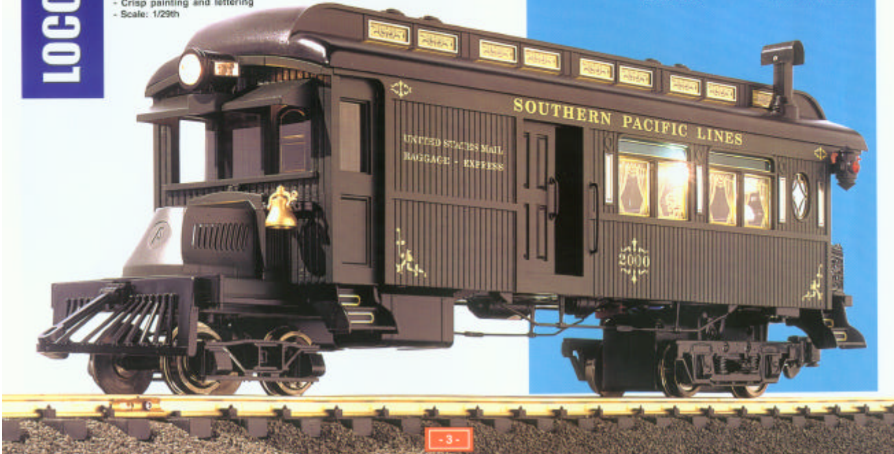
- 3 -